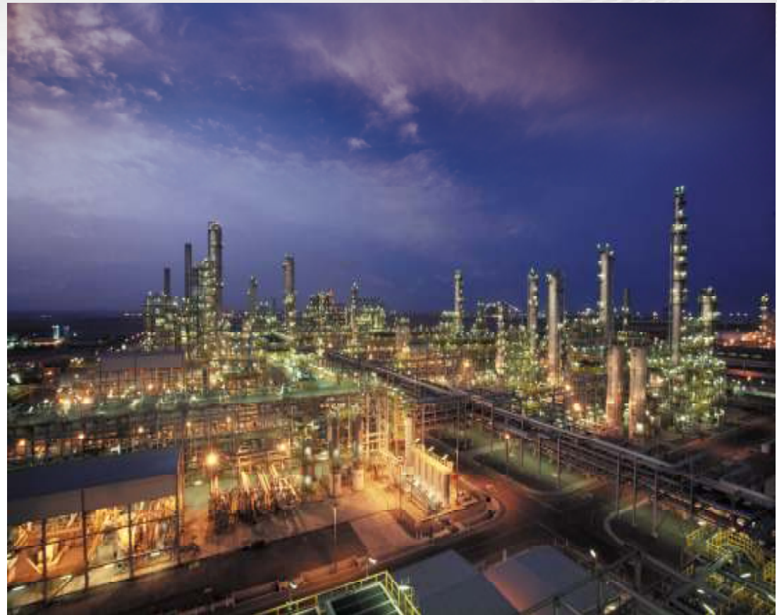
<Oman, Sohar Aromatics Project>